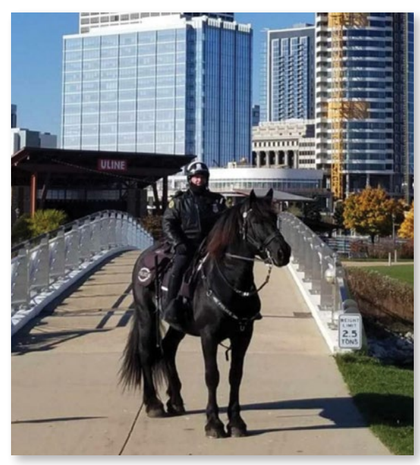
Gus on patrol in Milwaukee, 2023