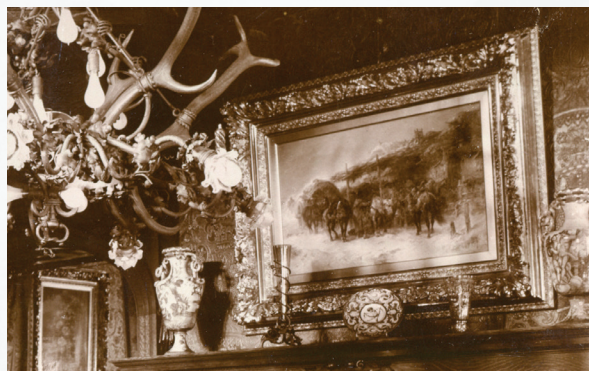
Adolf Schreyer's Halt before a Wallachian Station above the Pabst Mansion's reception hall fireplace, 1897.