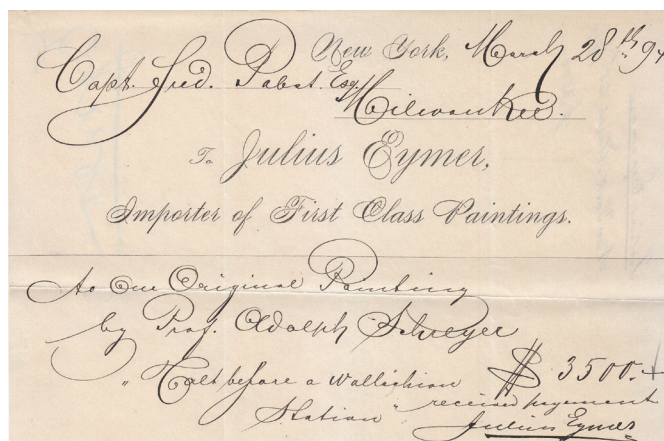
Receipt for purchase of Halt before a Wallachian Station , 1894