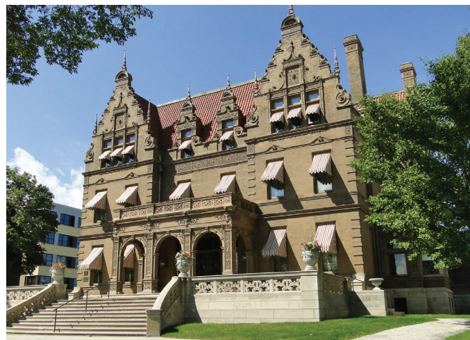
Visitors to the Pabst Mansion might see representatives from Strang Inc. in various phases of an assessment while on tour.